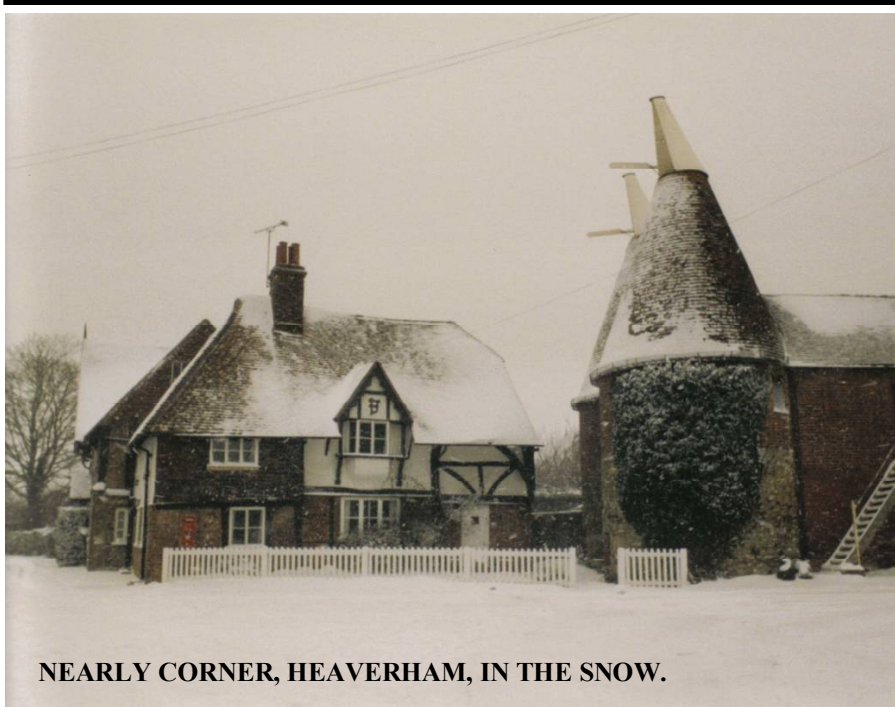
NEARLY CORNER, HEAVERHAM, IN THE SNOW.