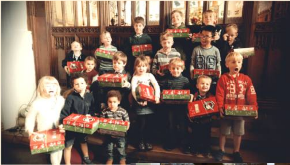
Once again, St. Mary's keenly supported the Operation Christmas Child shoebox appeal.