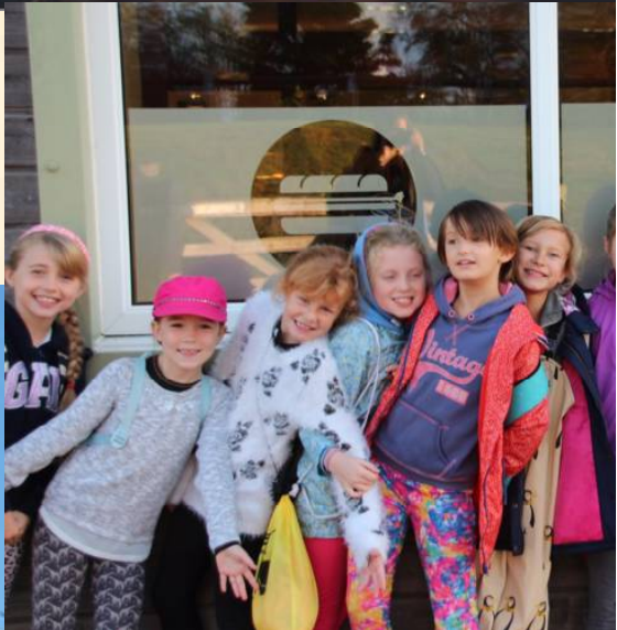
1st Kemsing Brownies at the PGL Centre at Windy Hill. They swung, crawled, fenced, and did other things they didn't think they could. Oh, and they had a