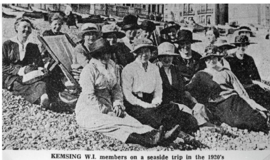
KEMSING W.I. members on a seaside trip in the 1920's

over 180lbs of raspberry jam was made and later sold for a small profit. After the war they ran the Village Library, formed the first Girl Guide troop, a tennis club and gave regular entertainments for the village. They enjoyed going on outings, this one above to Hastings.. Contd. Page 30.