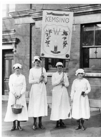
Showing the flag at Maidstone

In 1915, Kemsing was a small rural village with less than 700 inhabitants. Most of the population worked on the land, but the First World War had already been