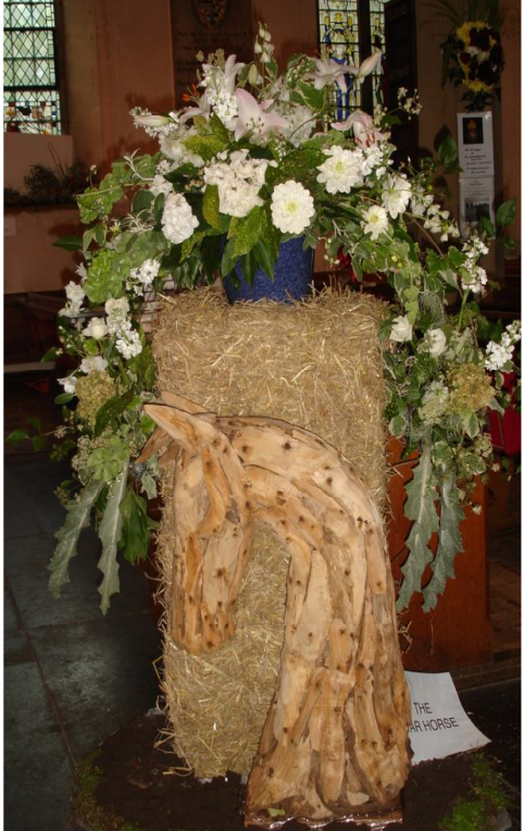
The War Horse (above), Dover Patrol (top) and from War to Peace (right).

St Mary's Church Flowers arrangers were responsible for the splendid tribute to those who served during World War One. These are a selection of photos from the event which took place from 31st July to August 4th. See pages 16 and 17 for more photos of the events which took place over that weekend.