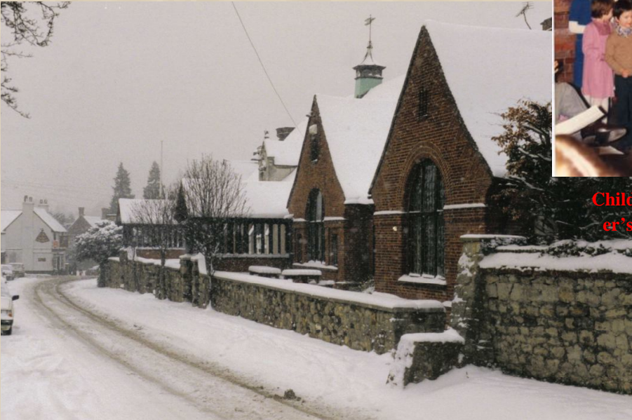
Children at a K er's Concert i