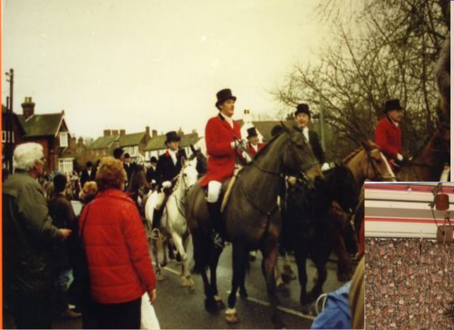
Above: The Boxing Day hunt in the 1980's.