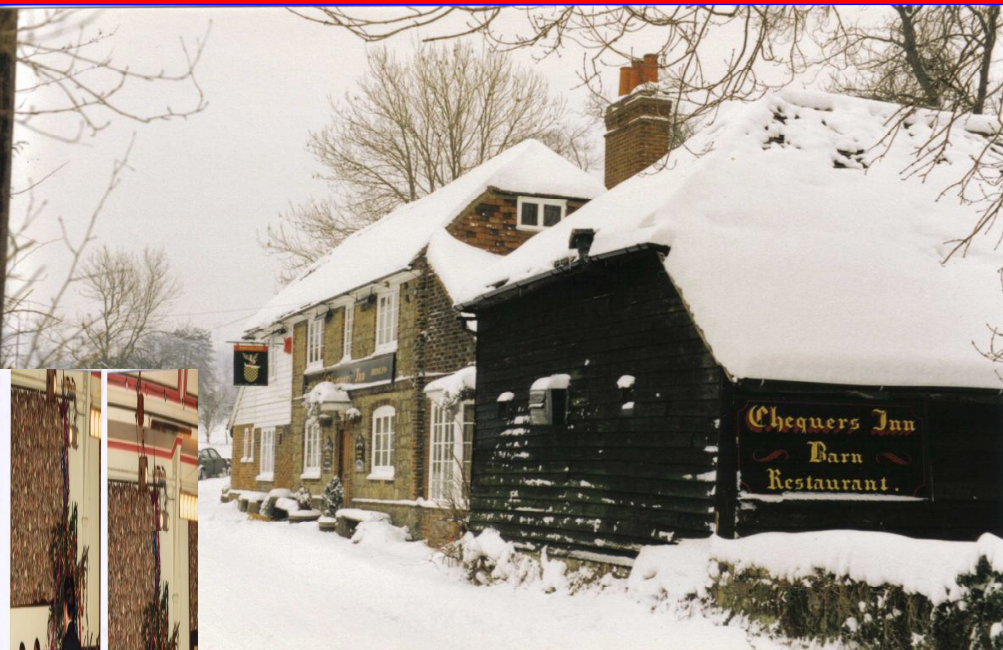
The Chequers at Heaverham in the snow.