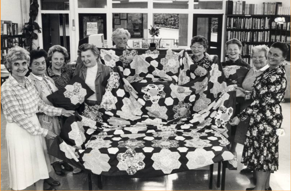
PHOTO FROM 1985 SHOWING A QUILT MADE BY MEMBERS OF KEMSING AFTERNOON W.I. —HOW MANY DO YOU RECOGNISE?

THE HERITAGE CENTRE LADIES HARD AT WORK ON THE ARCHIVE